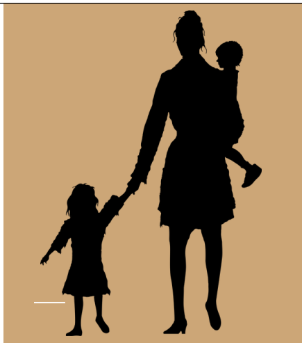
Bread for the World's 2020 Offering of Letters to Congress: Better Nutrition, Better Tomorrow

Due to centuries of inequitable public policies in our nation's history, communities of color reside in these areas at significantly higher rates. One in 2 Indigenous, 1 in 4 African Americans, and 1 in 6 Hispanics live and go to school in areas of concentrated poverty compared to 1 in 13 whites.